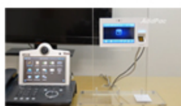
Time Attendance SIP Video Door Phone (RFID&FingerPrint) AP-TAS150