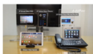
Smart IP Wall PAD AP-VWP100