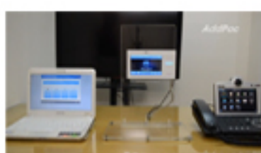
Time Attendance SIP Video Door Phone(RFID) AP-TAS80